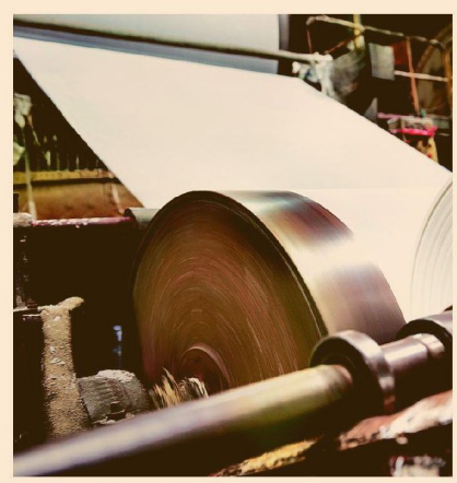
AT RECORD HIGH

His company reduced long-term debt by ₹1 billion in the past year and renegotiated interest rates on high cost